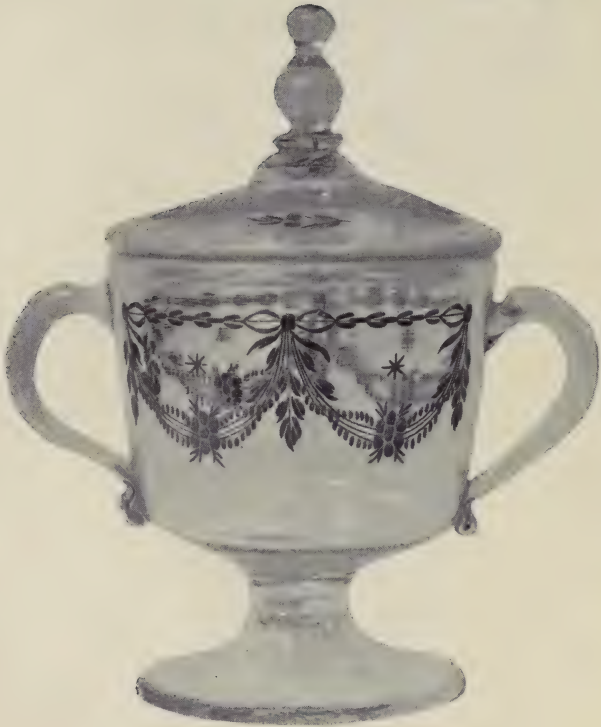
SUGAR BOWL San Ildefonso